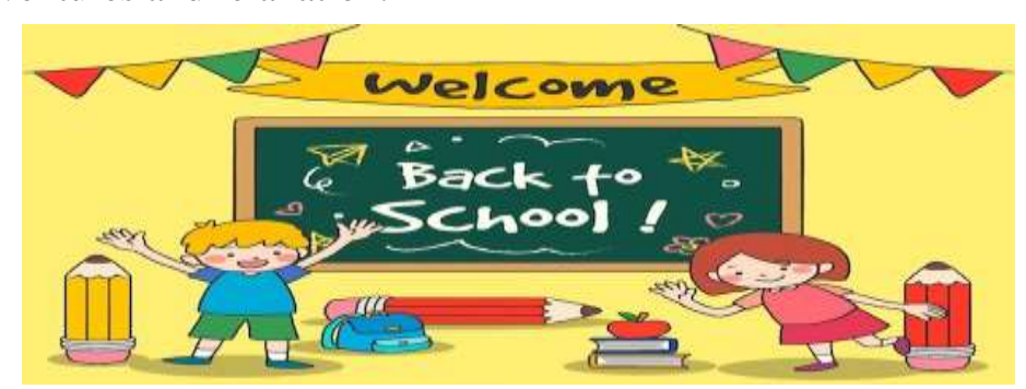
Academically we will cover _

After a month- long break, we are eagerly looking forward to welcoming all our Students back. We hope they had a great time during their vacations and are exhilarated to be back to the school. Back-to-school season always brings up so many emotions. Reopening of school after summer break is a time for new aspirations and rejuvenating dreams. It is time to enter the school with new vigour and fresh vibes. Students will be embraced wholeheartedly with utmost jubilation and affection after a fun filled summer break which we believe was full of adventures and relaxation.